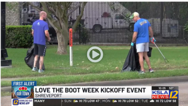
Volunteers across Louisiana took to the streets Friday (April 17) to pick up trash and kick off Love the Boot Week.

Volunteers collected 50,000 pounds of trash in Shreveport on opening day