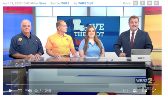
BATON ROUGE - Officials in West Baton Rouge Parish are preparing to participate in the annual statewide litter cleanup.