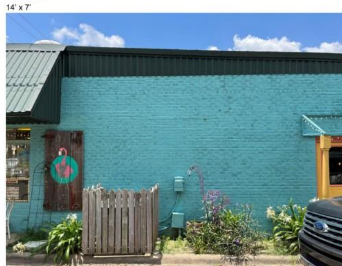
Artists are encouraged to visit the mural location to consider site specificity in their proposals. The mural will be installed on the east-facing wall of the Funky Flea located at 829 Napoleon Ave., Sunset, Louisiana, 70584.

The proposal must also include the concept, materials, installation requirements, details of maintenance, and budget. Please note that the brick is highly textured.