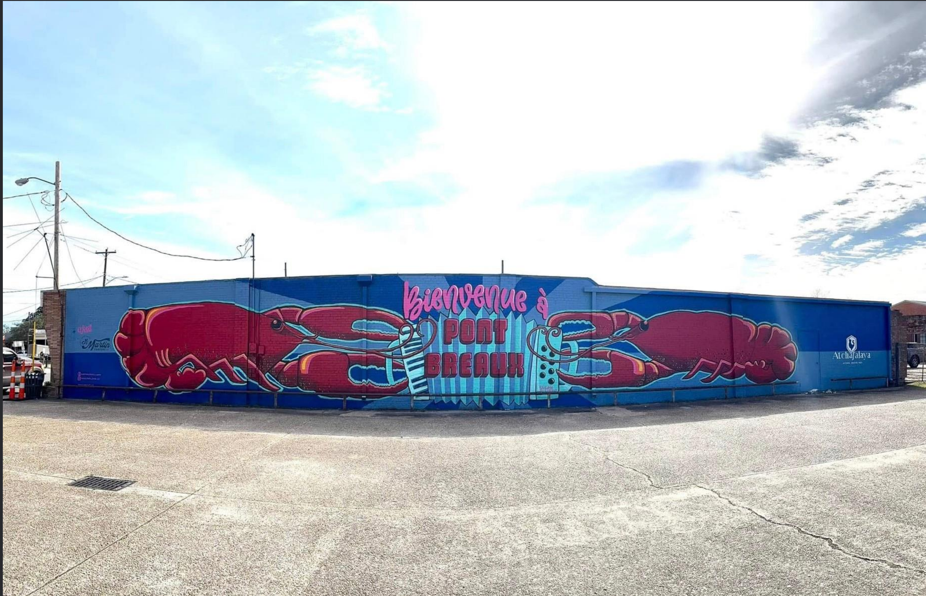
Sarah Melancon, Breau Bridge, photo courtesy of Atchafalaya National Heritage Area