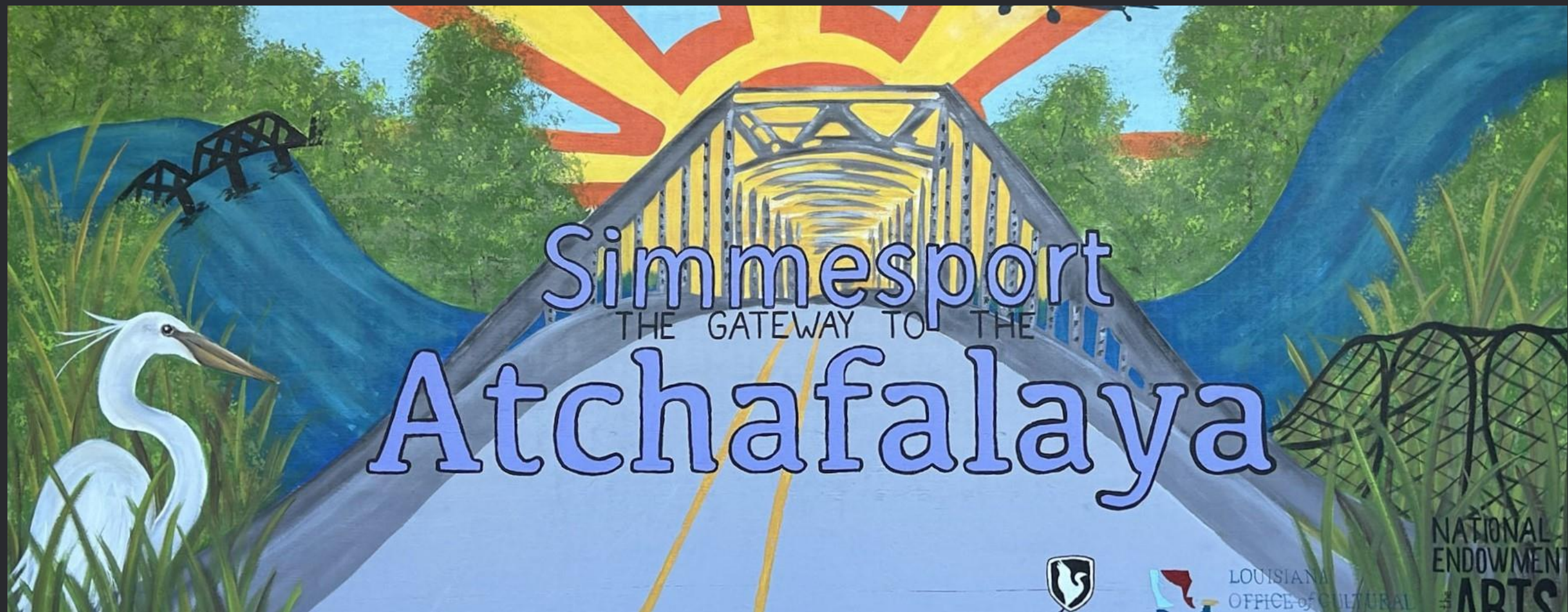
Chastity Sayer Smith, Atchafalaya Mural, 2024. Bayou des Glaises Cultural District, photo courtesy of Bayou des Glaises Cultural District.