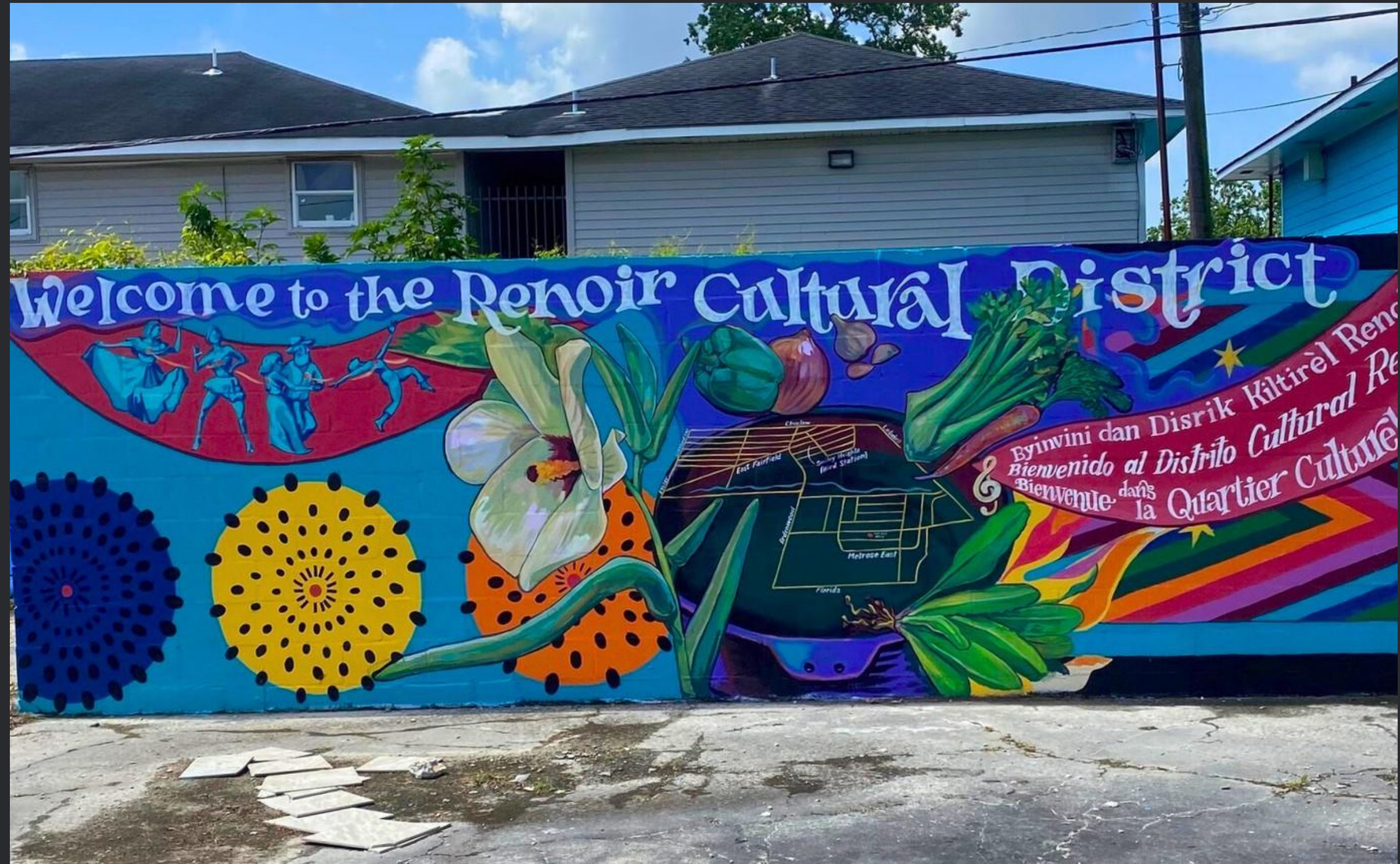
Ellen Ogden , Renoir Cultural District Mural, 2025. Renoir Cultural District, photo courtesy of The Red Stick Project.

Engage the community and stakeholders when launching a mural project. Murals should inspire and uplift, not create conflict. Site specificity is key. Artists should respond to the community, the call, and the space itself.