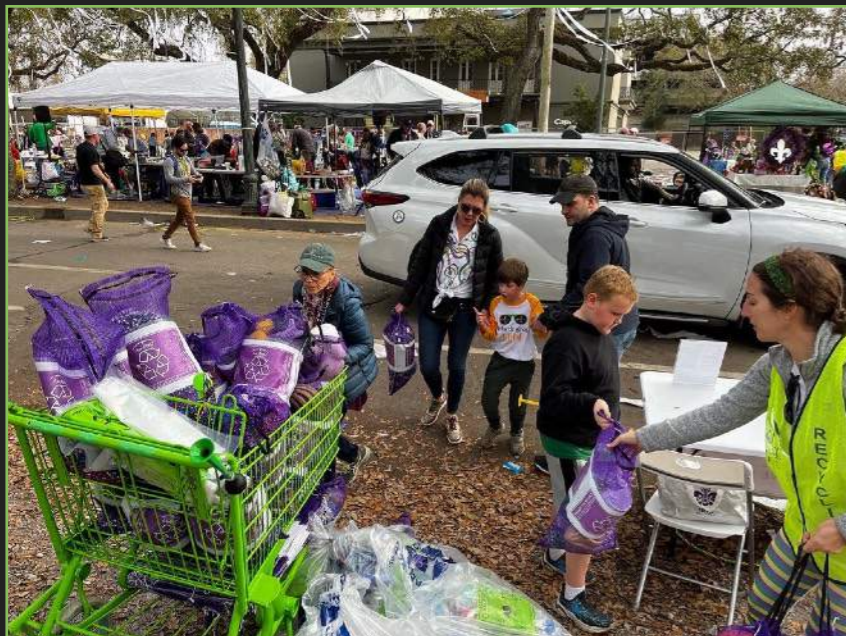
VISIBILITY & ACCESS