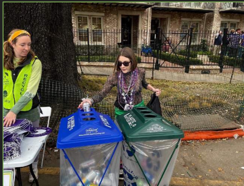
EMPOWERING PUBLIC VS. CLEAN UP CREW