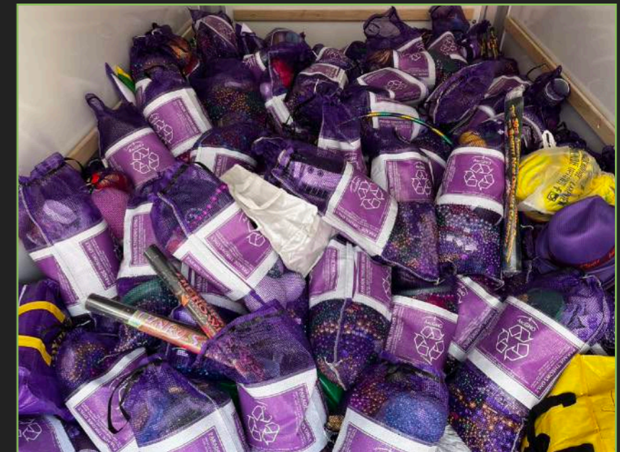
FREE THROW DONATION BAGS