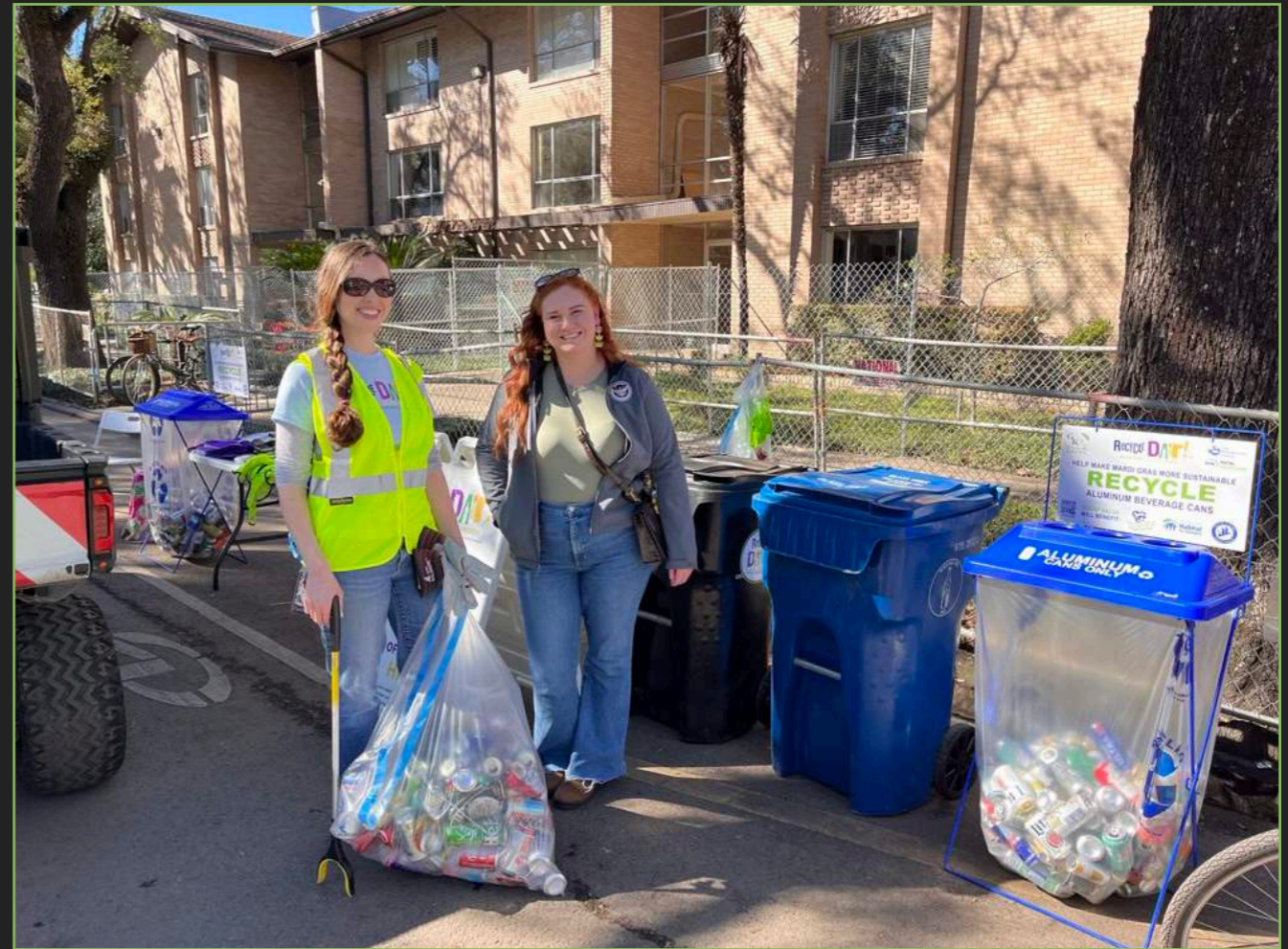
RECYCLING STATIONS, HUBS & POINTS ALONG TARGETED SECTION OF ROUTE